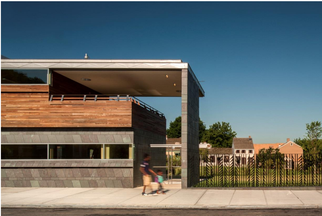
The new Education and Arts Building at the Weeksville Heritage Center in Brooklyn (Nic Lehoux)

New York, NY, January 13, 2019 – A new exhibition organized by the Center for Architecture in Greenwich Village will highlight 15 years of superior public building projects created through the collaboration of the NYC Department of Design and Construction (DDC) and many of the country's most renowned architecture and design firms, plus many small and emerging firms. Featuring 22 municipal projects, Public Works: Reflecting on 15 Years of Project Excellence for New York City , presents the visionary designs developed for a range of City buildings, from firehouses to libraries to community health clinics, and how they enhance communities while contributing to a thriving, healthy, sustainable and resilient City.